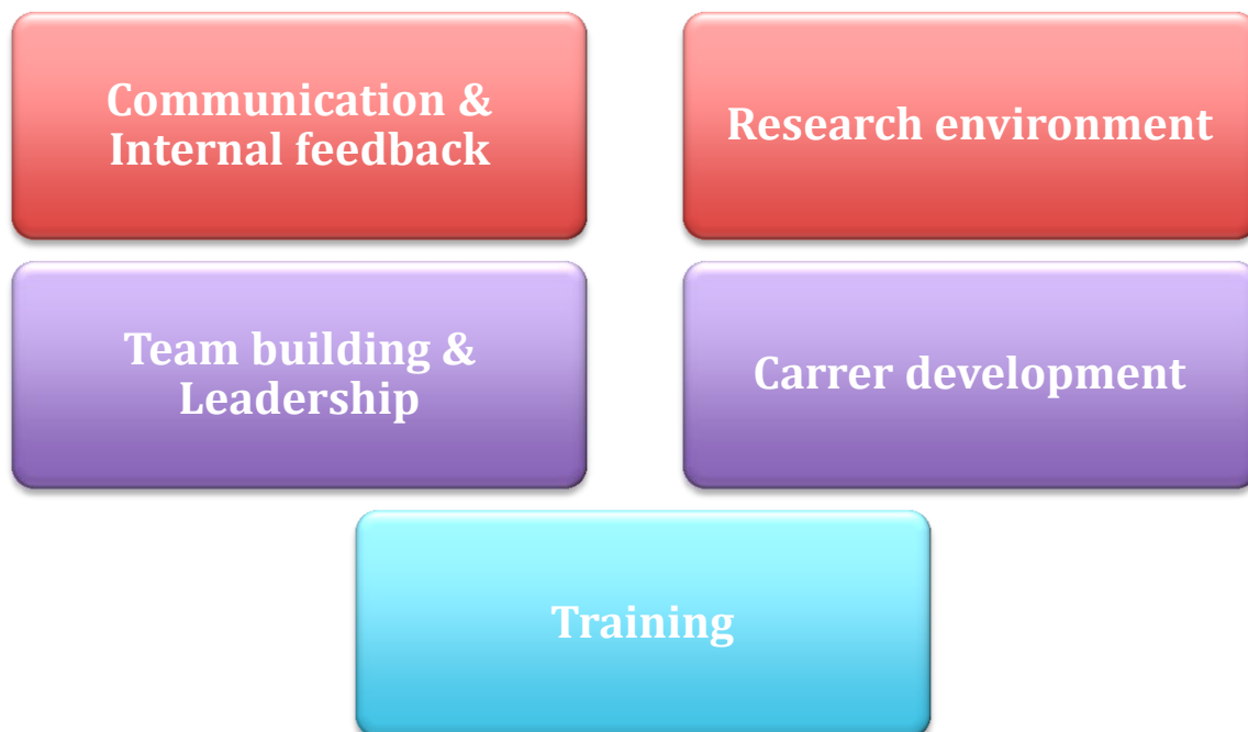
Fig 1: BCAM HR Strategic Areas

These actions have been grouped in the following strategic action areas: